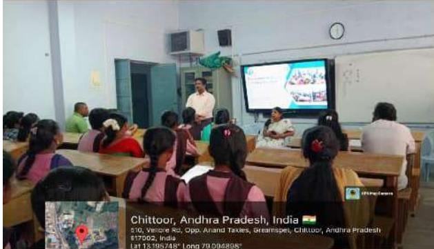
Chittoor, Andhra Pradesh, India 510, Vellore Rd, Opp. Anand Takies, Greampet, Chittoor, Andhra Pradesh, 517002, India Lat 13.195748° Long 79.094898°