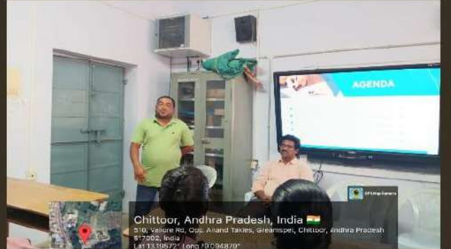
Chittoor, Andhra Pradesh, India 510, Vellore Rd, Opp. Anand Takies, Greampet, Chittoor, Andhra Pradesh, 517002, India Lat 13.19572° Long 79.094879°