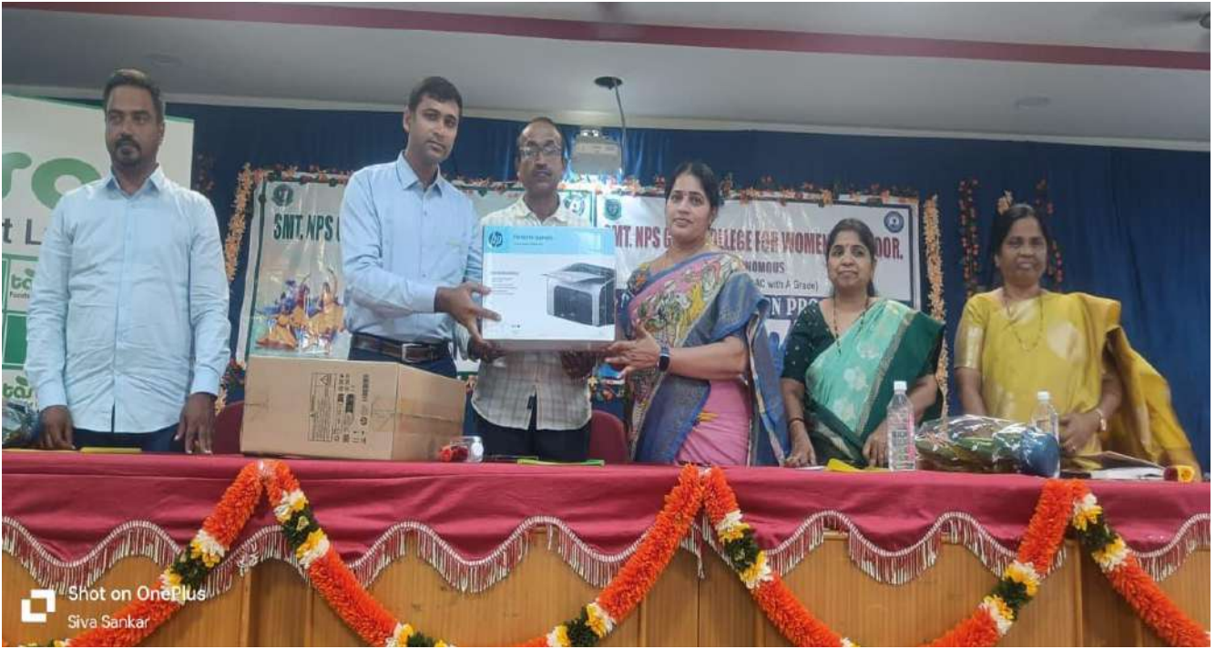
Shot on OnePlus Siva Sankar