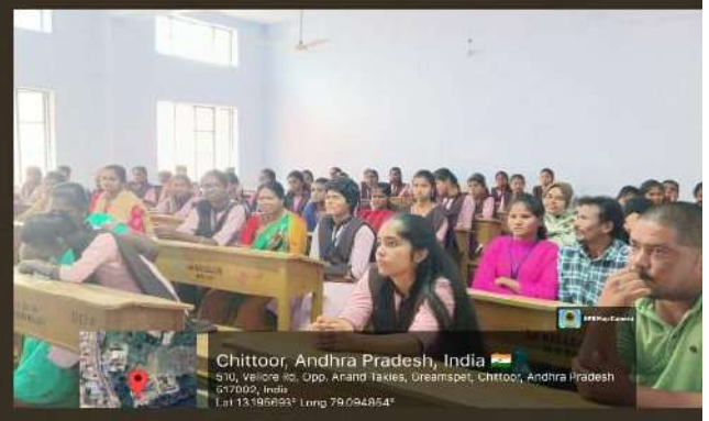
Chittoor, Andhra Pradesh, India 510, Vellore Rd, Opp. Anand Takies, Greampet, Chittoor, Andhra Pradesh, 517002, India Lat 13.195899° Long 79.094854°