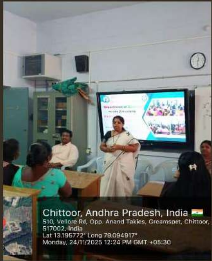
Chittoor, Andhra Pradesh, India 510, Vellore Rd, Opp. Anand Takies, Greampet, Chittoor, 517002, India Lat 13.195772° Long 79.094917° Monday, 24/11/2025 12:24 PM GMT +05:30