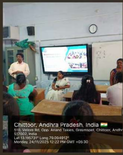
Chittoor, Andhra Pradesh, India 510, Vellore Rd, Opp. Anand Takies, Greampet, Chittoor, Andhra Pradesh, 517002, India Lat 13.195731° Long 79.094912° Monday, 24/11/2025 12:22 PM GMT +05:30